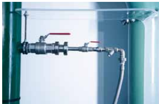
SOLVOX inline injector installation.

The low investment costs for SOLVOX® oxygen injection equipment, including measurement and control unit, quickly pay off through reduced need for maintenance, repair and restoration work, and odor control programs: SOLVOX efficiently improves wastewater purification.