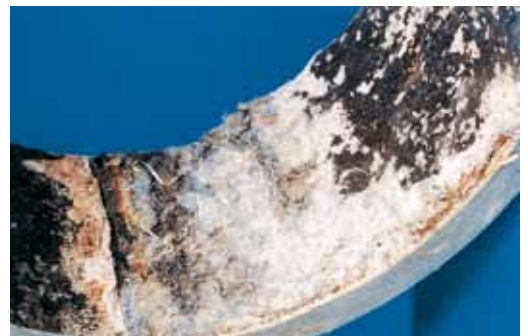
Pipework corrosion damage caused by bacterial degradation.